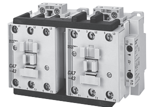
CAU7-43-22-120 reversing contactor