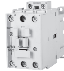
CAN7 NEMA1 labeled contactor (AC)